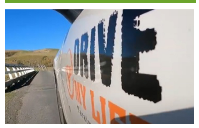
Trafinz Safety: Certificate of Merit Road Safety Southland: 'Drive my Life'