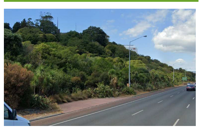
Trafinz Safety: Certificate of Merit Waka Kotahi - Auckland Systems Management: 'Police Enforcement Hardstand Areas'