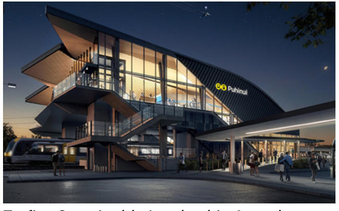
Trafinz Sustainable Leadership Award Auckland Transport / McConnell Dowell: 'Puhinui Station Interchange'