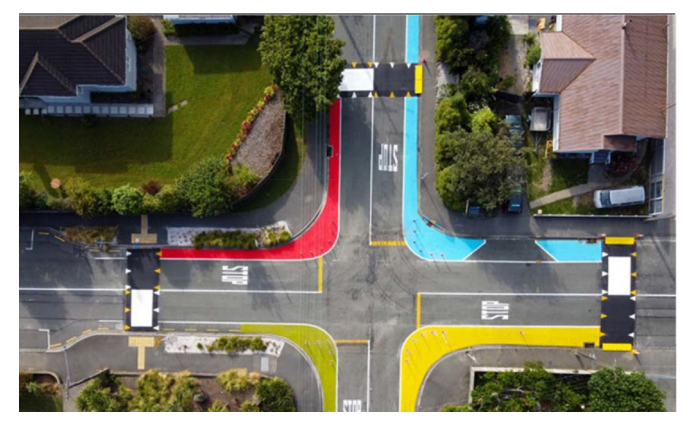
Trafinz Sustainable Leadership Award Nelson City Council: 'Innovating Streets – Nelson South'