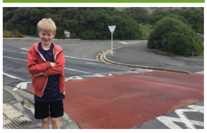
Trafinz Safety: Certificate of Merit Stantec New Zealand: 'Zebra Crossing: A threatened species in NZ?'